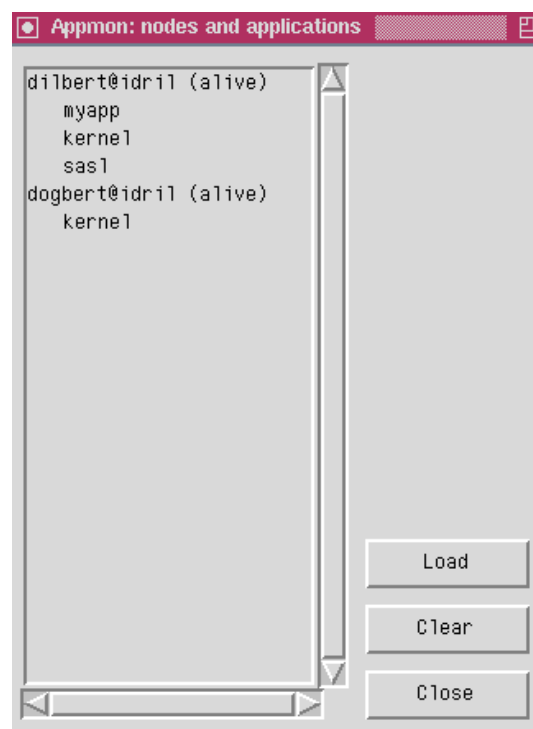
Figure 1.3: The Listbox Window.

The listbox window lists all nodes and applications. This window can be more easy to use than the normal, graphical user interface when the system consists of a large number of nodes and/or applications.