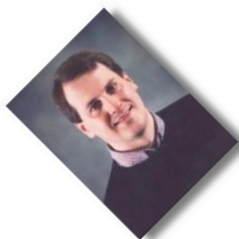
Figure 2—Image of the author scaled by 0.5 and rotated by 45°.